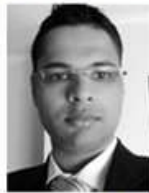
Communications & Marketing