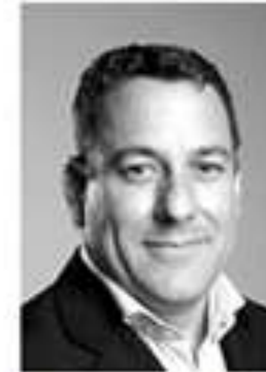
Employee Benefits & Tax