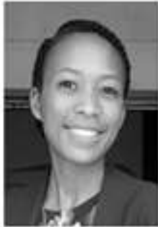
Conference & Reward Awards