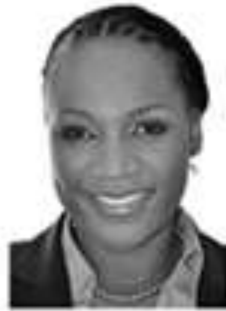
Stakeholder Engagement & Advocacy