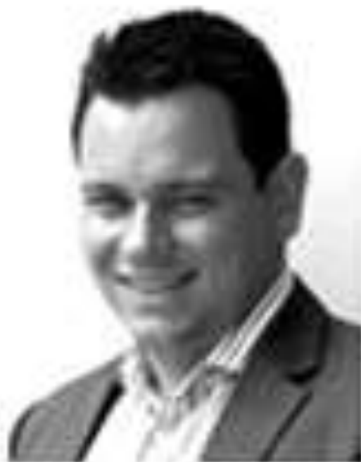
International Mobility Group (IMG)