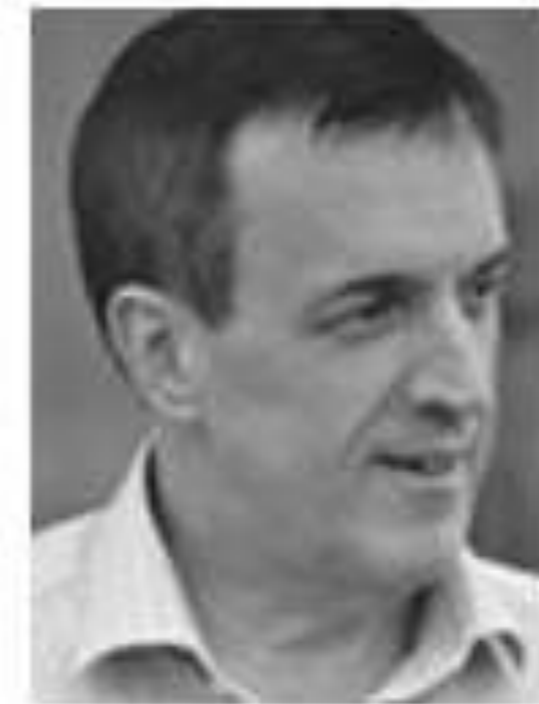
Western Cape Chair