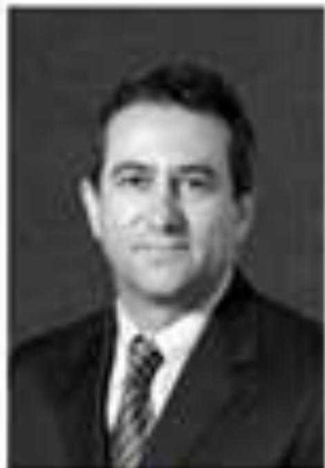
Education & Africa Reward Association